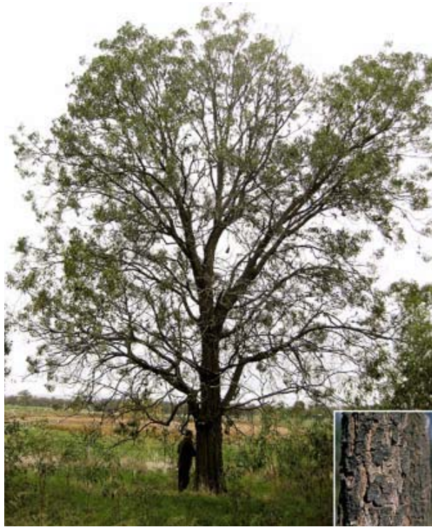
A – Old tree with insert showing bark.