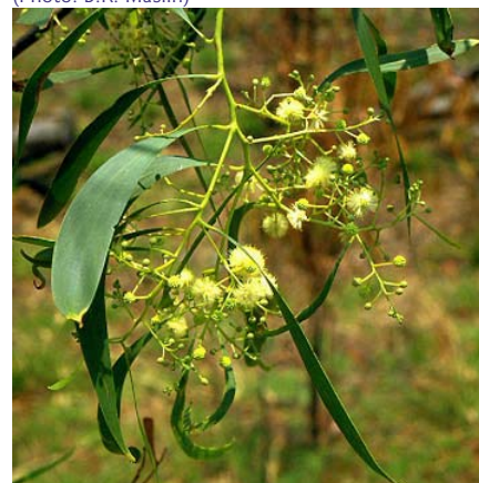
F – Branch showing pale coloured-heads (in racemes) & multinerved phyllodes.