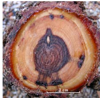
D – Section of stem showing dark brown heartwood.