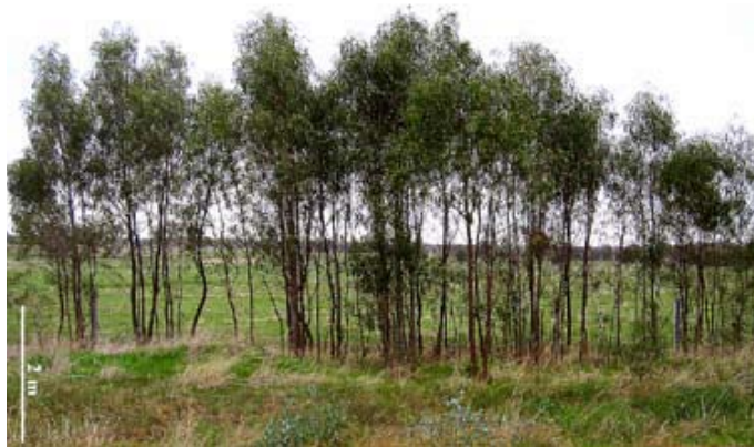
C – Roadside stand of young suckering plants.