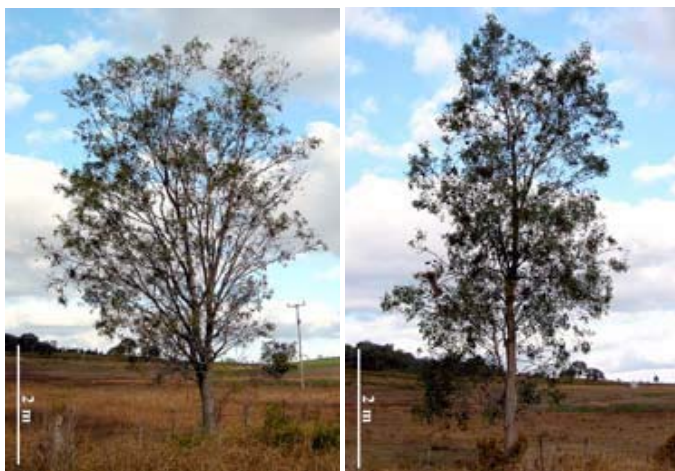
E – Plants near Mudgee, N.S.W., showing habit variation.