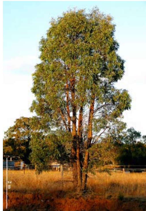
B – Well-formed adolescent plant with 3 main stems.